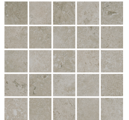
89132/M12 Sand mosaic