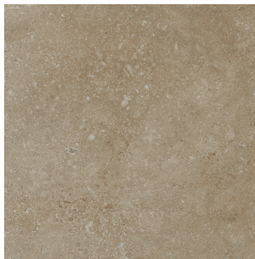
89123 18x18 Clay