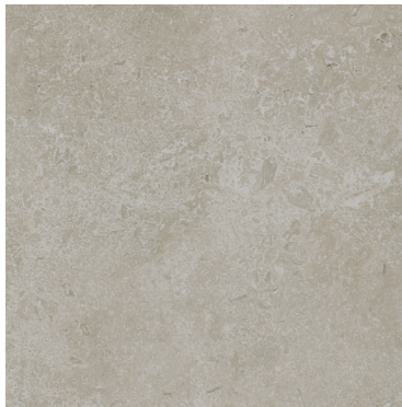
89132 18x18 Sand