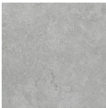
89103 18x18 Quarry