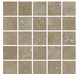
89123/M12 Clay mosaic