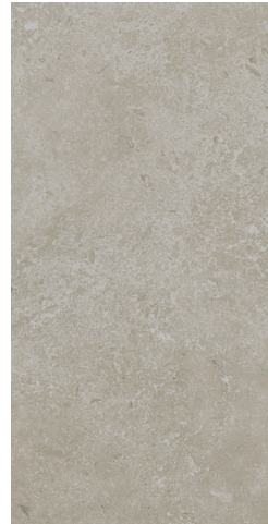
89132 12x24 Sand