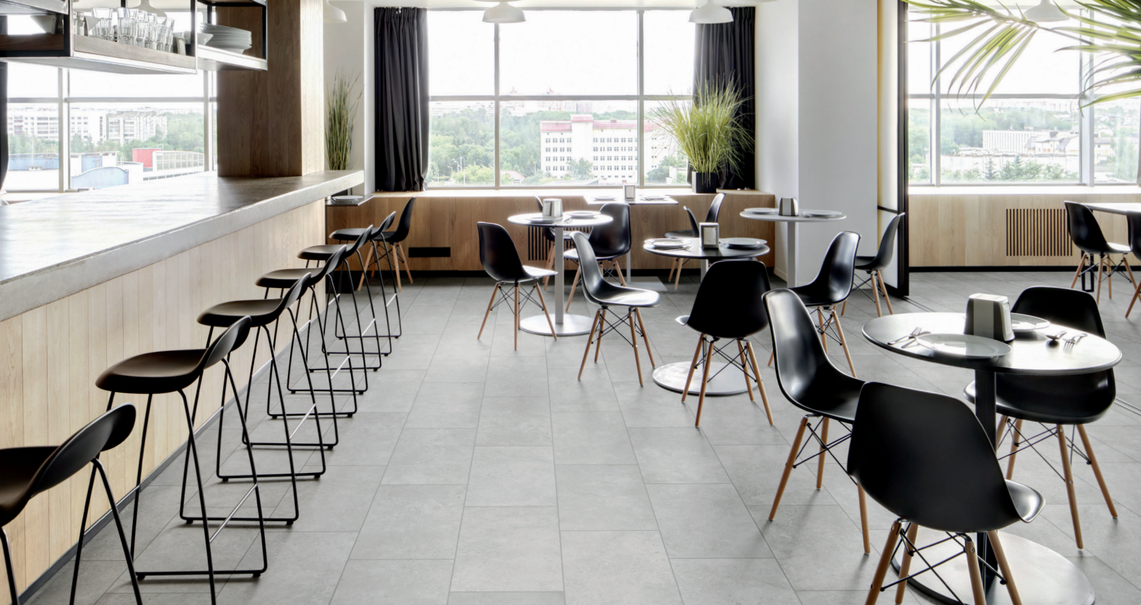
Shown: 89103 12x24 Quarry