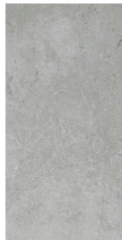
89103 12x24 Quarry