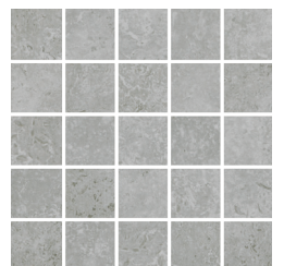
89103/M12 Quarry mosaic