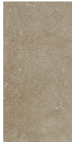
89123 12x24 Clay