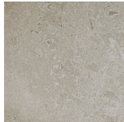
89132 12x12 Sand