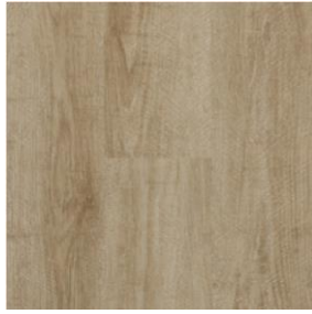
32CO082 | 32CO082G Cooper's Oak Bay