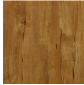
32HM186 | 32HM186G Heart Maple Golden Rose