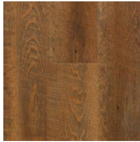
32IN544 | 32IN544G Flamed Oak Canyon