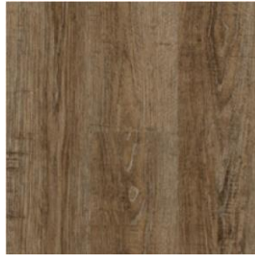
32CO083 | 32CO083G Cooper's Oak Roan