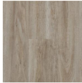
32LDP151 | 32LDP151G Lodge Plank Gray Pearl