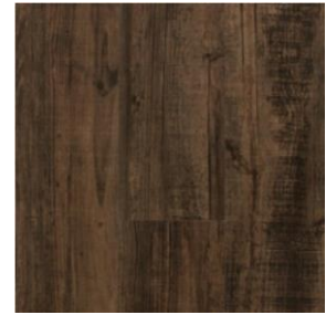
32LP1023 | 32LP1023G Long Pine Black & Tan