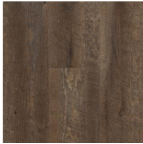
32IN542 | 32IN542G Flamed Oak Pewter