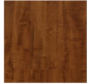
32IN401 | 32IN401G Jatoba Cayenne