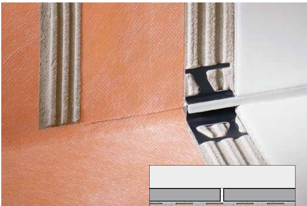
8.1 Schluter®-KERDI 8.1 Schluter®-KERDI-DS

KERDI-KERS-B are preformed, seamless corners for waterproofing 135° angles between triangular shower benches