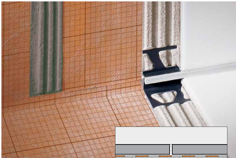
8.1 Schluter®-KERDI 8.1 Schluter®-KERDI-DS

Preformed, seamless corners include the following. KERDI-KERECK-F are used to seal 90° inside and outside corners. KERDI-