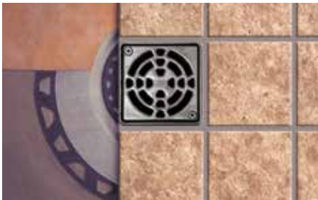
Schluter®-KERDI-DRAIN assembly with Schluter®-KERDI waterproofing membrane.

KERDI and KERDI-DS are waterproof and resistant to most chemicals commonly encountered in tiled environments. They are resistant to aging and will not rot. KERDI and KERDI-DS are highly resistant to saline solutions, acid and alkaline solutions, many organic solvents, alcohols, and oils. Information regarding their resistance to specific substances can be provided if concentration, temperature, and duration of exposure are known. For acid-resistant coverings, use an epoxy adhesive to set and grout the tile.